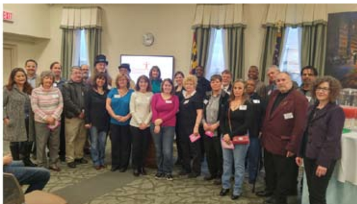
Artists in the Winter Show at Waldorf West Library