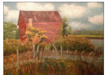
Barn and Boat Greenwich, New Jersey