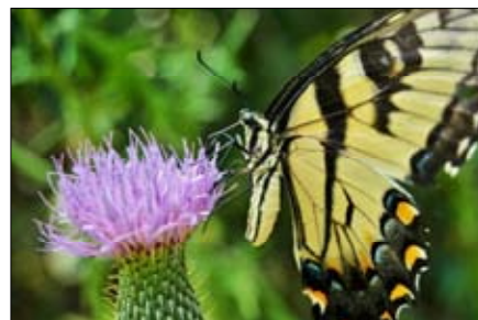
El Rey Del Sol