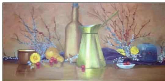
Brass Pitcher Still Life