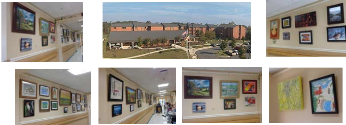
Exhibit Runs through April 19, 2017

In partnership with the Charles County Arts Alliance, Charlotte Hall Veterans Home opened a new public art exhibit, currently showcasing 37 artists and 55 works of art - their largest exhibit to date! The gallery is located along the E-Wing Assisted Living Dining Hallway and will be on display through April 19, 2017.