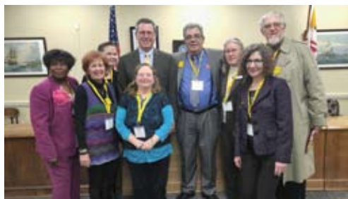
CCAA met with elected officials at Maryland Arts Day 2016.

Go to https://app.etapestry.com/hosted/MarylandCitizensfortheArts/OnlineRegistration.html to register.