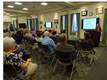
CCAA presents the artists for the Fall-Winter Show at Waldorf West Library