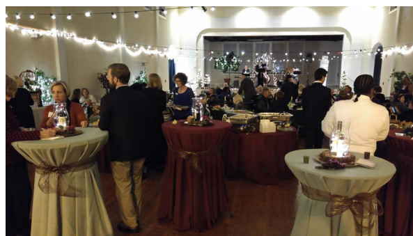
Photos from the 2016 CCAA Gala