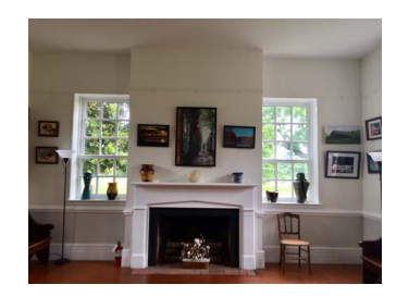
Exhibit Runs Through June 15

For the third year, the CCAA and SRPT partnered to present an art exhibit at the Historic Port Tobacco Courthouse, located at 8430 Commerce Street, Port Tobacco, MD 20677 . Fourteen artists with works representing photography, acrylics, oils, and sculpture pieces will be on display through June 15. Admission is free; the Courthouse hours are Wednesday through Sunday, 10:00 am to 4:00 pm.