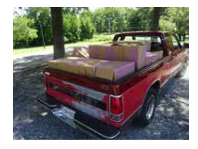
Loaded and ready for delivery!