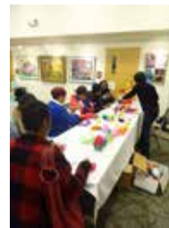
Paper Flower Making