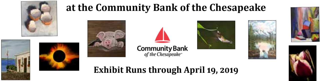
Exhibit Runs through April 19, 2019

On December 28, 2018, the Community Bank of the Chesapeake, in partnership with the Charles County Arts Alliance, opened a new show displaying 53 works of art by 27 artists. This is the 11th show to open at the Waldorf Branch since the partnership began in 2015.