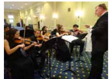
Music provided by the String Ensemble of Walter Johnson High School.