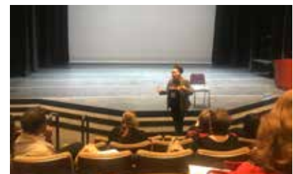
Breakout Sessions from the left: Legal, Arts Organizations and Artists, and Self-Marketing and Development.

For more information about Maryland Citizens for the Arts or the Maryland ArtsLAB, visit https://mdarts.org/events/artslab-2019 .