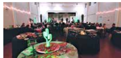
The Silent Auction offered a wide variety of bid items .