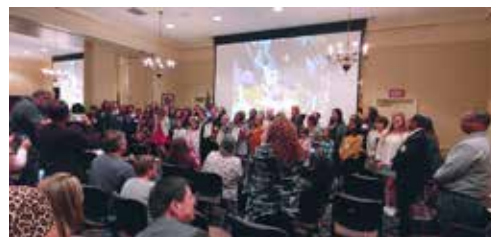
All the student participants and their art teachers.