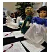
And the evening continued with food, fun, and music . . .