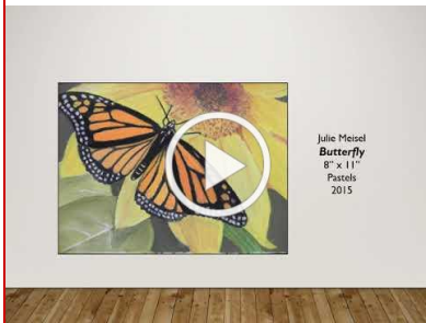
Community Bank of the Chesapeake - Waldorf Branch April - August 2019