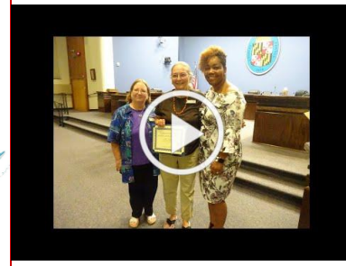
Commissioners Building "Artists Without Limits" 2019