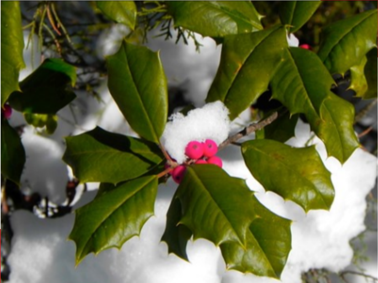
"Looking At Winter" by Cecelia Dunay